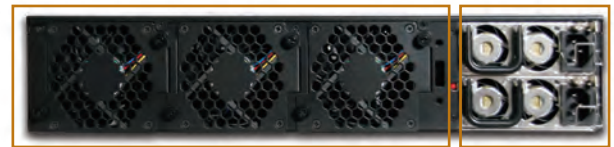
Removable Smart Fan